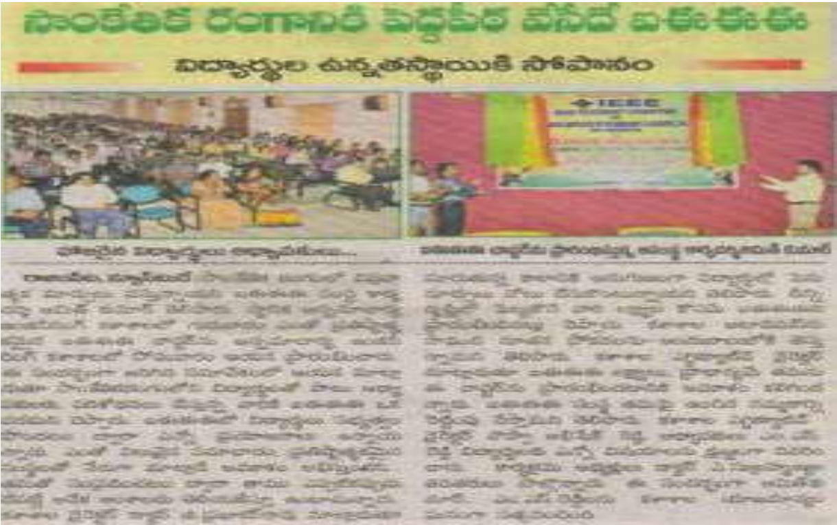
Published in Eenadu Local Paper on 28 th February, 2012.