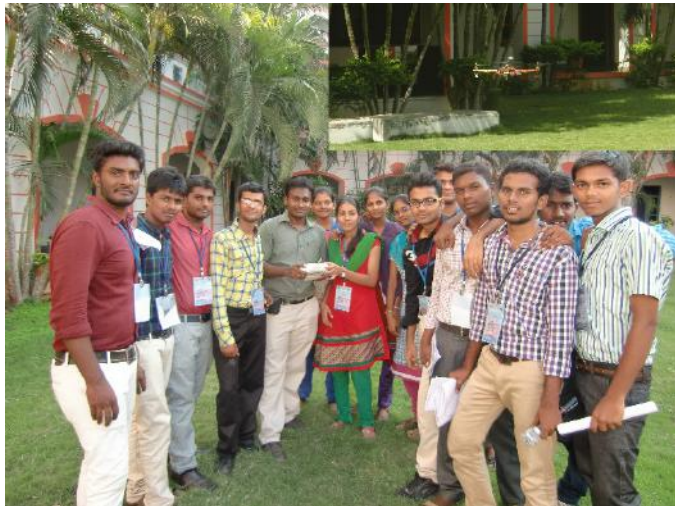
Participants with the quadcopter

A Two-Day Workshop Quadcopter was conducted by Times Global Com Institute affiliated to IIT-ECL on 15 th March 2015 for EEE, ME, and ECE students.