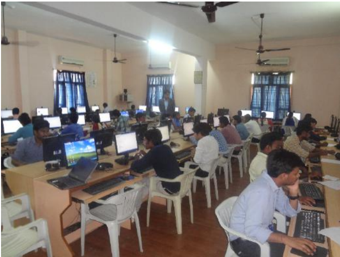
Students appearing for online exam