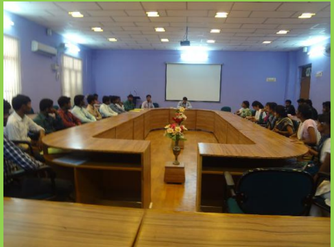
Candidates listening to the experts from FACE