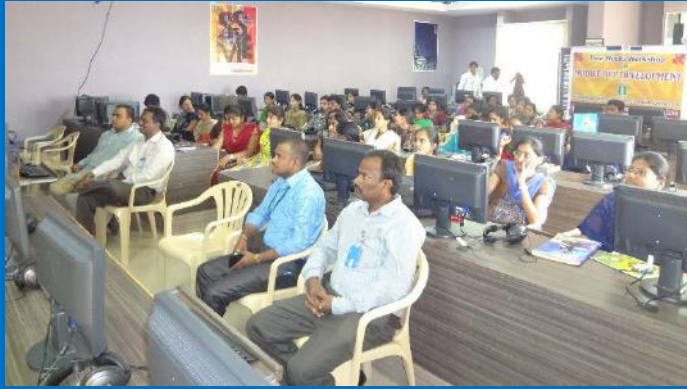
Faculty and students witnessing the inauguration online

Andhra Pradesh Skills Development Centre was formally inaugurated online by Honorable Chief Minister Sri N. Chandra Babu Naidu on 19 th January. AITS is among the 17 colleges chosen for this honor across the state.