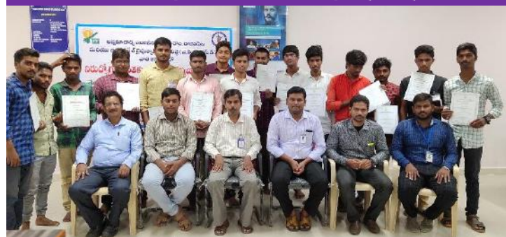
Participants of the training programme