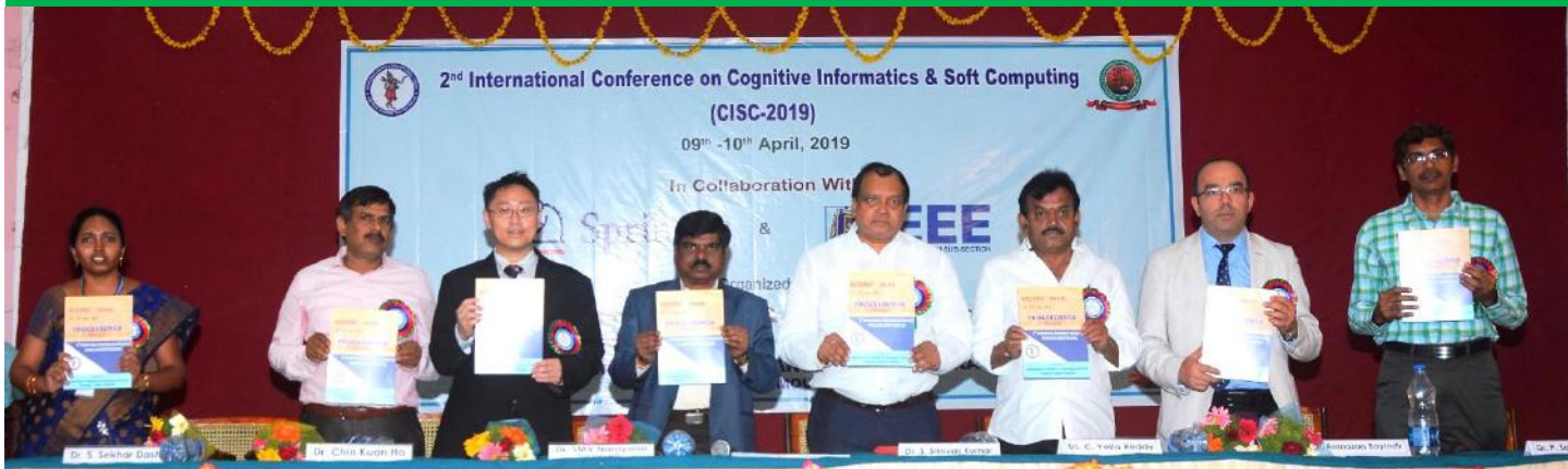
Delegates releasing IC-CISC conference proceedings

An International Conference “Cognitive Informatics and Soft Computing” was held on the campus on 9th April, 2019. Department of EEE organized the event in alliance with Springer and I EEE Subsection, Anathapuramu.