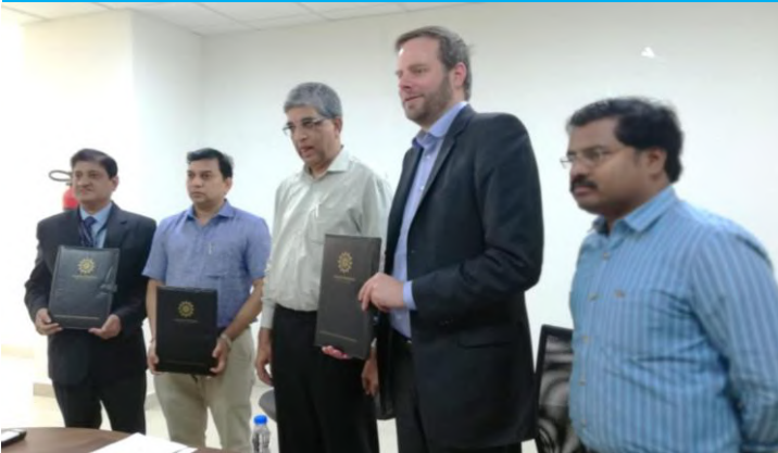
Members from ECM Germany at APSSDC