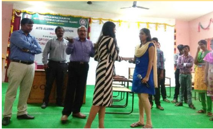
Students participating in an activity during the programme