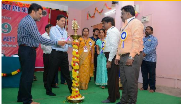
Inauguration of ATM 2K19