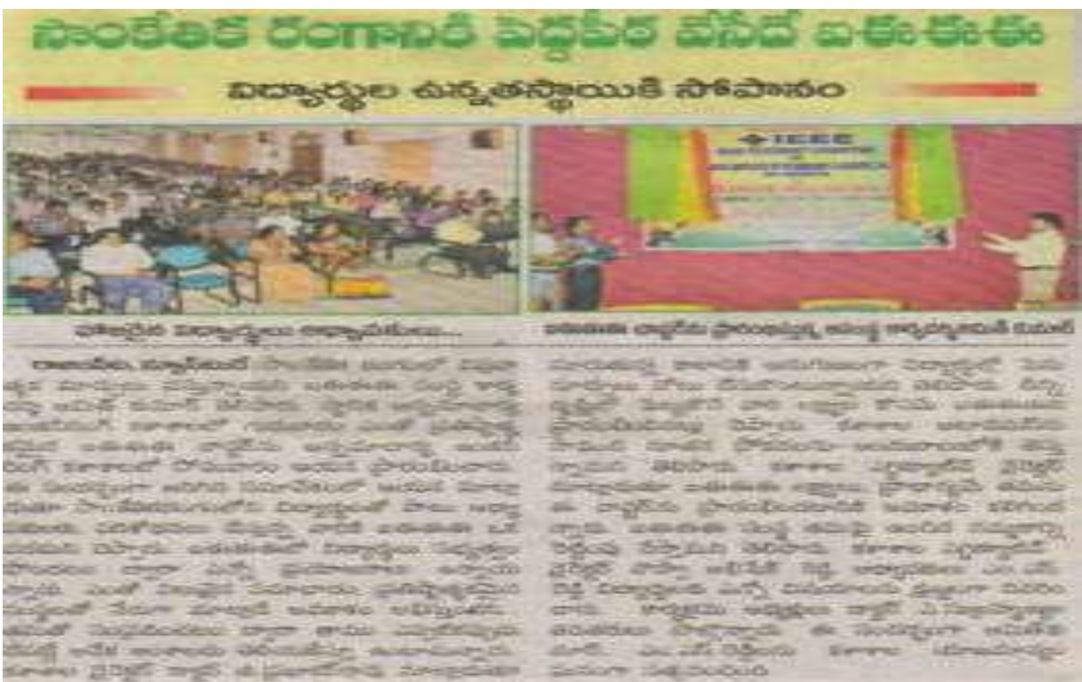
Published in Eenadu Local Paper on 28 th February, 2012.