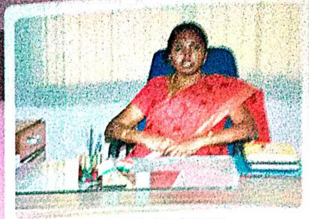
HOD & Professor,

The Department has trained the students for the students for various competitive examinations like GATE, IIT-JAM, GRE, TOEFL, GMAT etc.