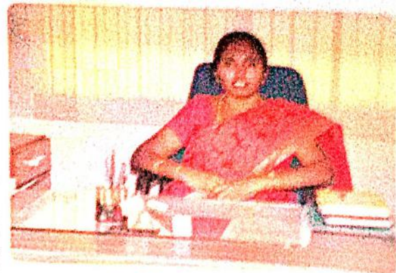
HOD & Professor

The department has framed the syllabus for the students kept in view to achieve the vision & mission, Program Educational Objectives & Program Outcomes are framed accordingly